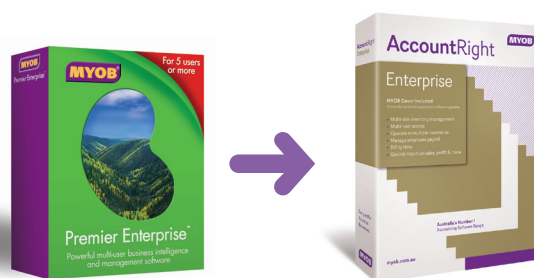
MYOB Premier Enterprise

Compare some of the features that have been added to MYOB accounting software since the release of MYOB Premier Enterprise v3 in 2005 to MYOB AccountRight Enterprise v19 in 2010.